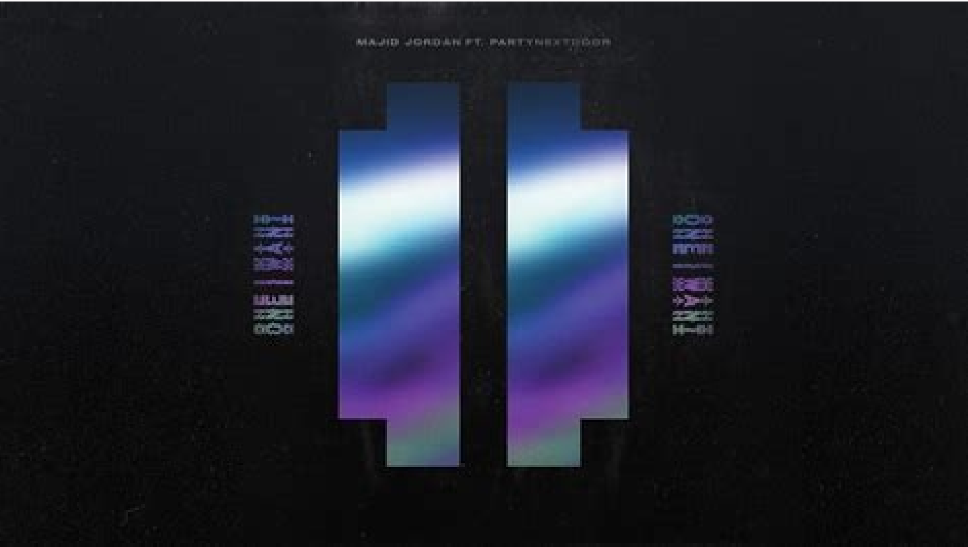
Majid jordan one i want download mp3. One i want majid jordan mp3 download musicpleer.